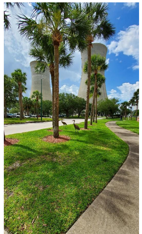
Stanton Energy Center Orlando