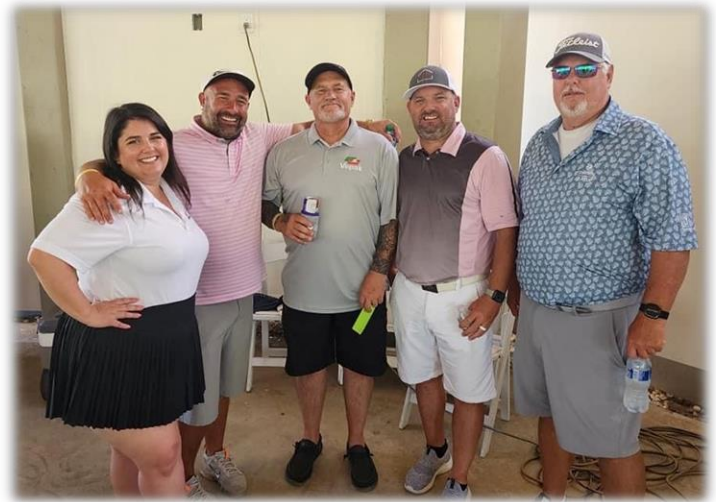
Congratulations to the 1st Place team from Vopak

On May 4th, the Louisiana Section Young Professionals Group (YPs) hosted the 12th Annual Section Golf Tournament at Pelican Point. The tournament featured a longest drive and closest to the hole contest. Following the completion of the tournament golfers and spectators alike gathered for a social and to enjoy the spring weather at Pelican Point's outdoor gazebo. We had our largest tournament ever with over twenty sponsors and 112 golfers! Our first-place team was Vopak and the PPG Industries team came in a close second with over $800 in prizes being awarded to participating golfers and teams. It was a beautiful day of golf, great food, and much more, all supporting a great cause. The tournament raised close to $9,000 with proceeds funding the continued growth of the Louisiana Section's YP Group and advancement of environmental leaders in Louisiana and across the Association. The YP group would like to thank all its supporters for the 12th Annual Tournament!