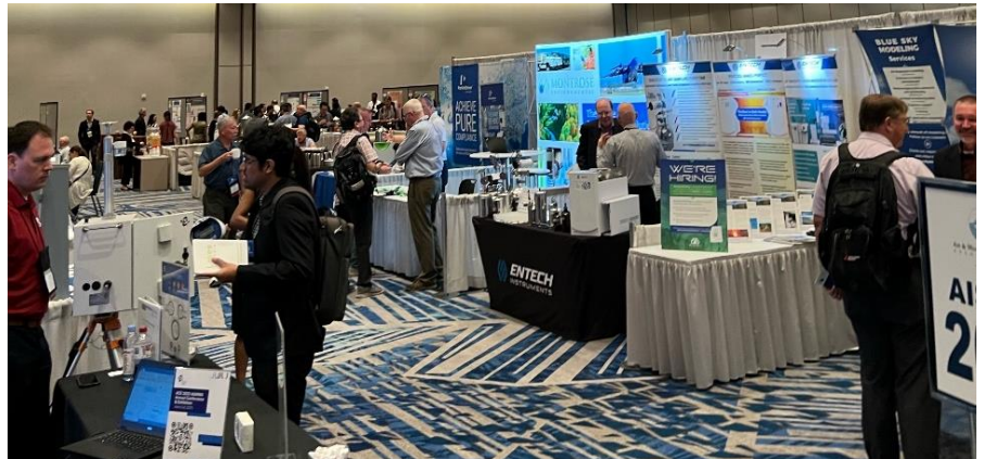
2023 ACE Exhibit Floor (Orlando, FL)

Try to stay cool for what is left of this summer, and I look forward to seeing many of you at future events and at the fall conference!