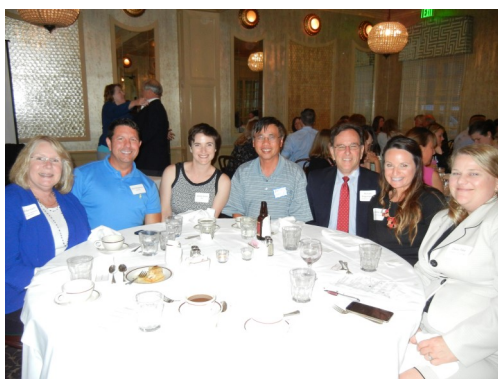
Pictured Above: Members socializing at the July Dinner Meeting