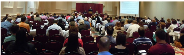
A packed house listens intently as a representative from LDEQ speaks

The Conference Committee received tremendous feedback about the expanded exhibitor space which allowed the most exhibitors we have had in the past several years; and the Conference Committee plans to keep the expanded exhibitor space for 2012! The Committee also received valuable feedback on the presenters and presentations, all of which will be considered as the Committee begins working on the 2012 Fall Conference. As attendee survey results were reviewed and discussed amongst the Committee, it is clear that the Conference Committee has done an exceptional job with each conference, setting high expectations from conference attendees. Thank you for expect-