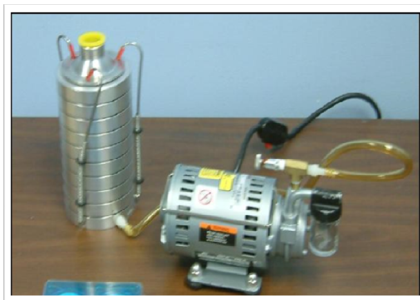
Figure 1: Thermo Anderson 8-Stage Cascade Impactor

The results of this research could be used to (a) estimate co-worker exposures to various pollutants, (b) estimate health risks, © design either new or improved ventilation systems to the weld shops, and (d) to comply with OSHA guidelines if excessive exposures are observed.