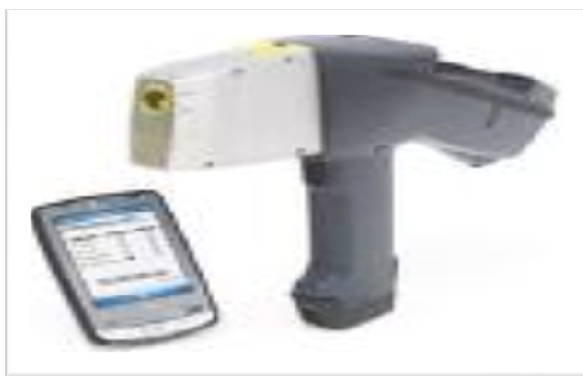
Figure 2: X-Ray Fluorescence (XRF) Spectrometer