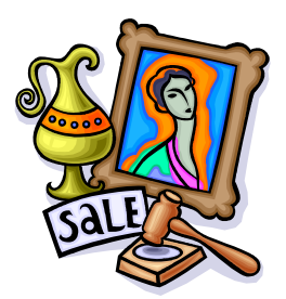
https://www.cmarket.com/auction/ AuctionHome.action? documentId=76418293

including gift certificates, collectibles, art, weekend retreats, and books for you to bid on! So give a little and get a lot in return- 100% of the money goes to scholarships. Refer your friends and colleagues!