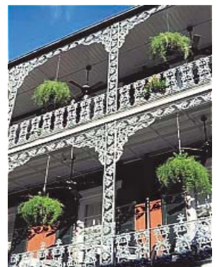
French Quarter Balcony

2006 AEC in New Orleans cited as a "unique and unparalleled opportunity for a first-rate program closely tied to A&WMA's mission"