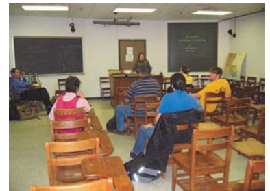
LSU Student Chapter Meeting

The 2006 DEQ Conference has been cancelled due to budgetary reasons. It is scheduled to return for 2007!