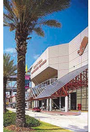
Morial Convention Center.

2006 AEC in New Orleans cited as a "unique and unparalleled opportunity for a first-rate program closely tied to A&WMA's mission"