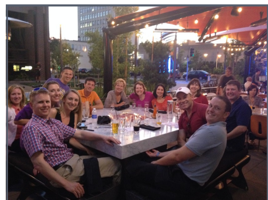
Above: Members networking at ACE!

While you're marking your calendars, be sure to set aside October 28 and 29 for our annual conference, which will be held at the Baton Rouge Marriott. The conference committee is now accepting abstracts for presentations; if you are interested, please send your abstract to