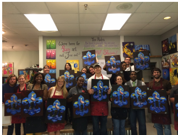
Above: Members at the first SW Chapter YP Event!