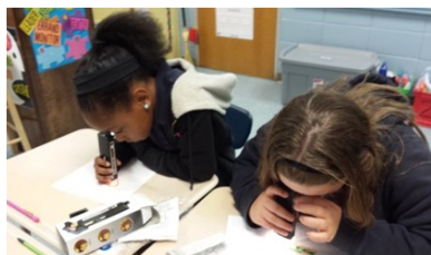
Pictured: 5th grade students at Devall Middle