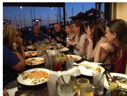
Above: LA Section YPs with A&WMA Board Members

What an amazing conference! I can't put into words what this experience has added to my personal and professional development and my drive to be more involved in the Section. I would like to thank the YP to ACE Committee for giving me this opportunity and everyone who participated in the YP Golf Tournament which provided the funds. Finally, I would like to leave you with this statement...WATCH OUT ACE NEW ORLEANS 2016!!"