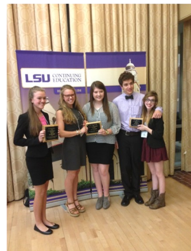
Above: 2014 Award Winners