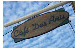
July Dinner Meeting Proposed NEW Location in Breaux Bridge!!

See Page 7 for a copy of the May Dinner Meeting Registration Form.