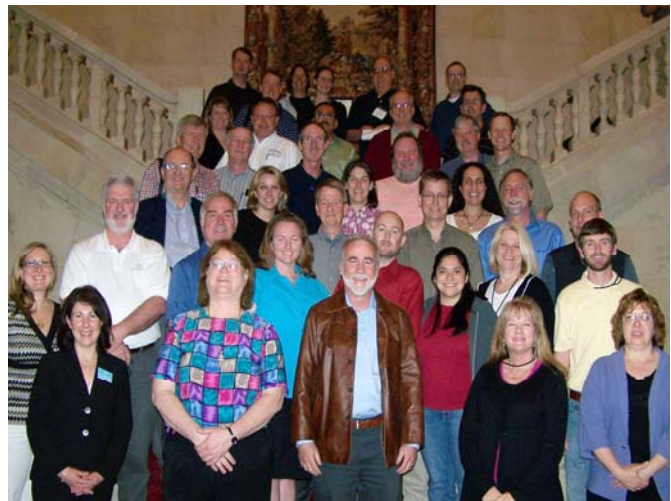
Above: Group picture of attendees.