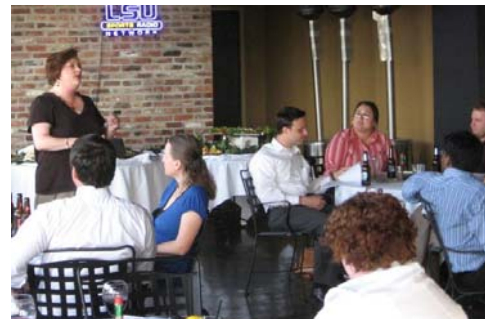
Above: View of presentation at YP Event.

its focus on YPs, the Section hopes to have one of the most active YP Groups in the Association.